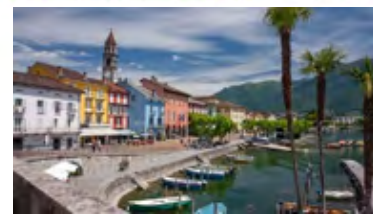
The old part of town, known as Città Vecchia, is full of interesting surprises: do not miss the palaces, churches, the Visconti Castle and the narrow alleys in which you breathe peace and tranquillity.